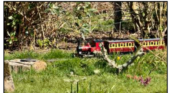
Above: Trains on Gigha! Well done to Nigel Braithwaite who recently raised £27 for Scotland's Charity Air Ambulance (SCAA) and £27 for The Sound of Gigha at the Drumallan Train Festival.