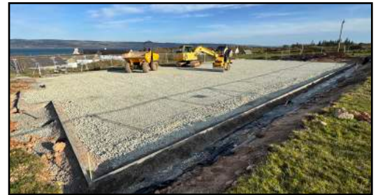
Above: Here is a view of our long-awaited MUGA under construction behind Gigha Hotel. Are you planning to make use of this new Gigha sport facility this summer?